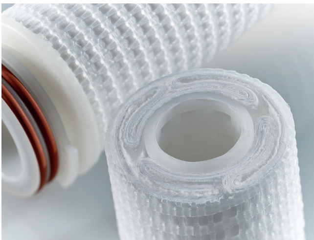
Fig. 2: Due to their innovative pleating, BECO PROTECT FS depth filter cartridges offer a large filter surface with high retention rates. This means that they are especially suitable for protecting downstream membrane filter cartridges in beverage filtration.

In a further test using 6,600 gallons (25,000 liters) each of a Spanish Merlot, French Chardonnay and European Rosé, the microbiological results with regard to bacterial load were confirmed (see Table 2). Although the load for the Chardonnay and the Rosé decreased after dealcoholisation, they still exhibited high values of > 100 CFU/ml. For the Merlot, the load was very high throughout the entire production process. It was only following the two-stage cartridge filtration that the colony-forming units were able