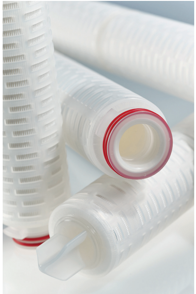
Fig. 3: BECO MEMBRAN PS Wine membrane filter cartridges have been specifically developed for the final filtration of wine and sparkling wine. Due to the high-quality polyether sulfone membranes, they also meet the requirements for the microbiological stability of alcohol-free beverages.

to be reduced to zero, allowing for a sterile bottling process for the alcohol-free wines.